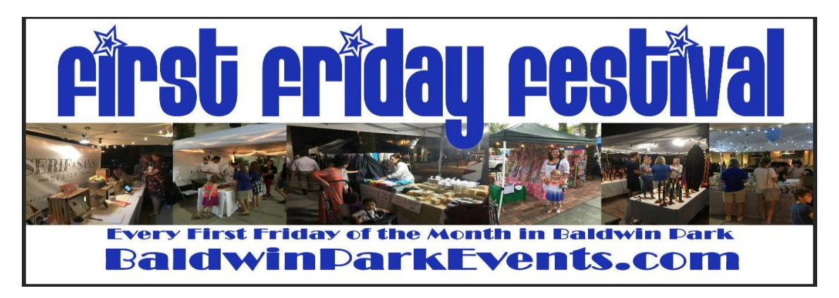
Fri Jul 7th 5:30pm - 9:30pm New Broad St & Jake St, Orlando, FL 32814, USA

The event will feature a Main Stage near the lake featuring DJ BradmasterJ and live music from Baldwin Park's very own, ROOM2 BAND. So, come early, stake out your perfect viewing spot, and then enjoy the evening in Village Center!